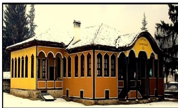
Fig. 2 The first class school in Koprivshitsa.

An important stage in the development of the Bulgarian educational process began in the 1830s with the establishment of new Bulgarian elementary schools where spoken Bulgarian was the language of teaching. Secular textbooks and materials were used such as Neofit Rilski's grammar, P. Beron's Fish Primer book, etc. Nayden Gerov also takes a worthy place among the most prominent Bulgarian enlighteners. He established in Koprivshitsa (1846) and Plovdiv (1850), and gradually in other settlements, the first independent class (secondary) schools.