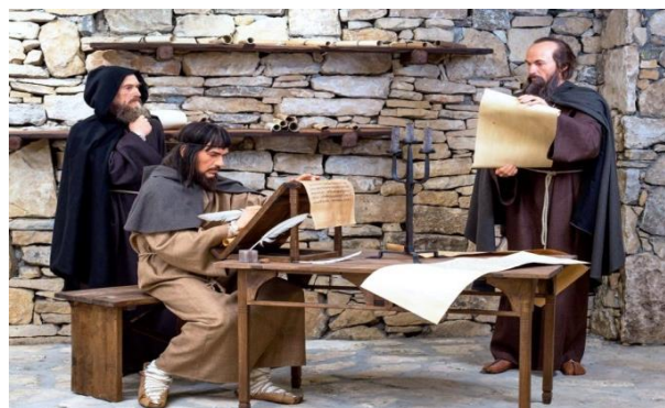
Fig. 1 Copy books.